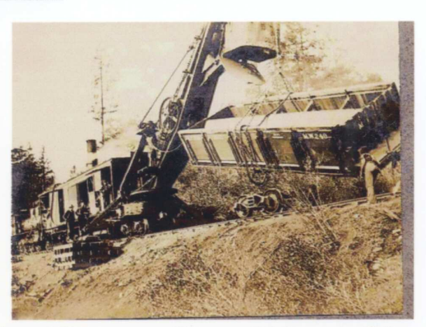
The two upper photos proves mishaps can happen anywhere. A Maintenance of Way gondola has gone off the rails and Southern Pacific has brought in one of their big hooks to re-rail the car. Notice the "V" shape floor that allows rock to move to both sides for unloading. The bottom left photo looks under the Wall Creek trestle. In the distance between the two stumps is a second trestle on the same railroad line below near Steinman. The bottom right photo looks upward at the Wall Creek trestle from the vantage point of the lower trestle. Notice the wooden slides placed to divert the dumping of fill to the outer sections of the trestle bents.