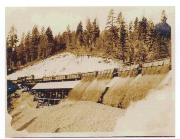
Here are a few more selections from the chapter archives. These six photos are part of a series of fourteen photos contained in a booklet published by the old Colestein Lodge along the Siskiyou Line near Hilt, CA. It appears these photos show reconstruction work near Siskiyou Summit circa 1905. Top left photo shows a train on the Whitepoint trestle before it was filled in. The Top Right photo shows a work train filling a trestle near Steinman, OR. The booklet is part of the collection of Rick Aubin.