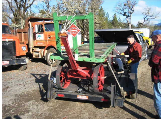
(LEFT) Syd, Bruce McGarvey and Steve do a final safety check to be sure the cart will make the trip back safely to the Railroad Park. —Rick Aubin photo

(RIGHT) This is the condition our baggage cart is in today. Since we're going to replace all the old wood, the plan is to disassemble the cart to strip the old paint off metal parts, apply new paint, and reassemble the cart. When done we'll stack several large steam trunks and boxes on the cart for a complete display. —Rick Aubin photo