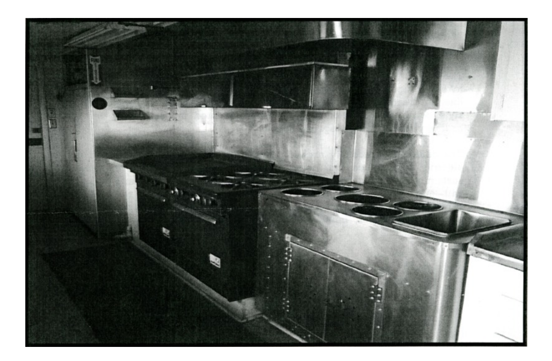
Our 1912 Pullman Diner

Can't wait to have a cook out...(cook in?)