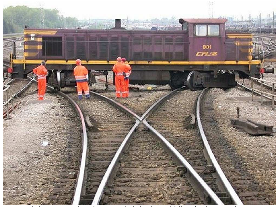
It is not good to thro a switch in the middle of a locomotive. That front truck sure has a great turning radius!!!