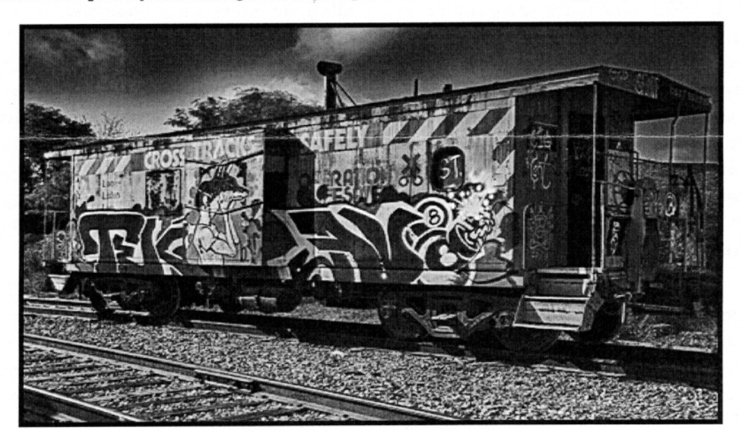
And they never yield to right of way

Can't afford to paint your rolling stock? Just park it on a remote siding for a couple of weeks.