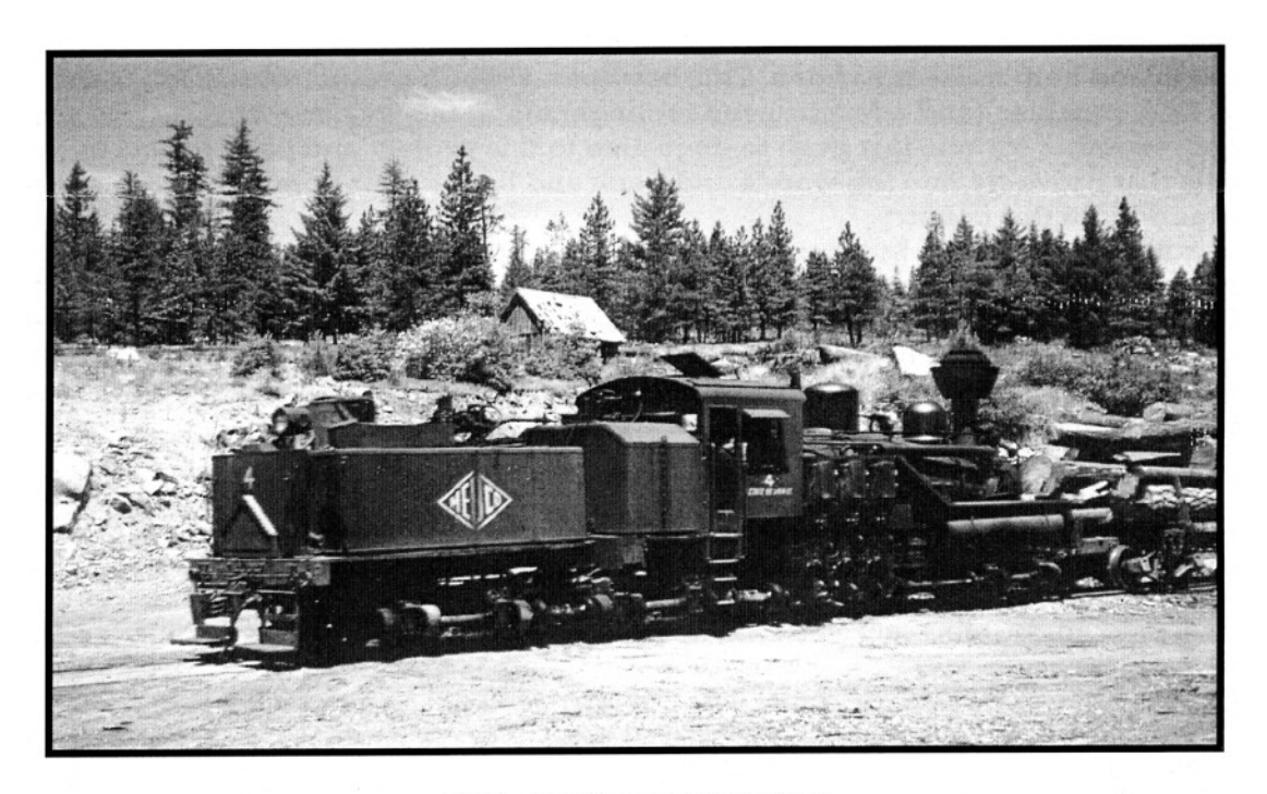
#4 Moving Some Loaded Flats

Water Water Everywhere But Not a Drop to Drink- Now that we are getting closer to completion of the Medco #4 project many of you have asked "what next?" At least initially the plan is to operate #4 at the railroad park if for no other reason than to do some test runs, tighten the odd bolt or two that may shake loose, take some pictures, shake hands and then move #4 to a permanent operational site. Since it became apparent that we would not be able to operate on the old Medco grade we have researched numerous other options with mixed results, we are currently in the process of revisiting some of those options with a new found determination to put #4 back on track. Anyone that would like to assist in this effort please contact me... Editor