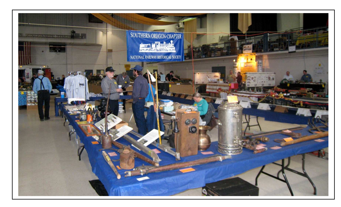
The historical society crew getting ready for the opening on Sunday morning.

We had another successful Rogue Valley Model Railroad show. As usual the historical society had a great display set up. Show attendance was over 4400 which is down about 600 from last year. We made $225.00 at our table plus our portion of the ticket sales. A BIG thanks to all of our members that worked at the show. Below are a few pictures from the show.