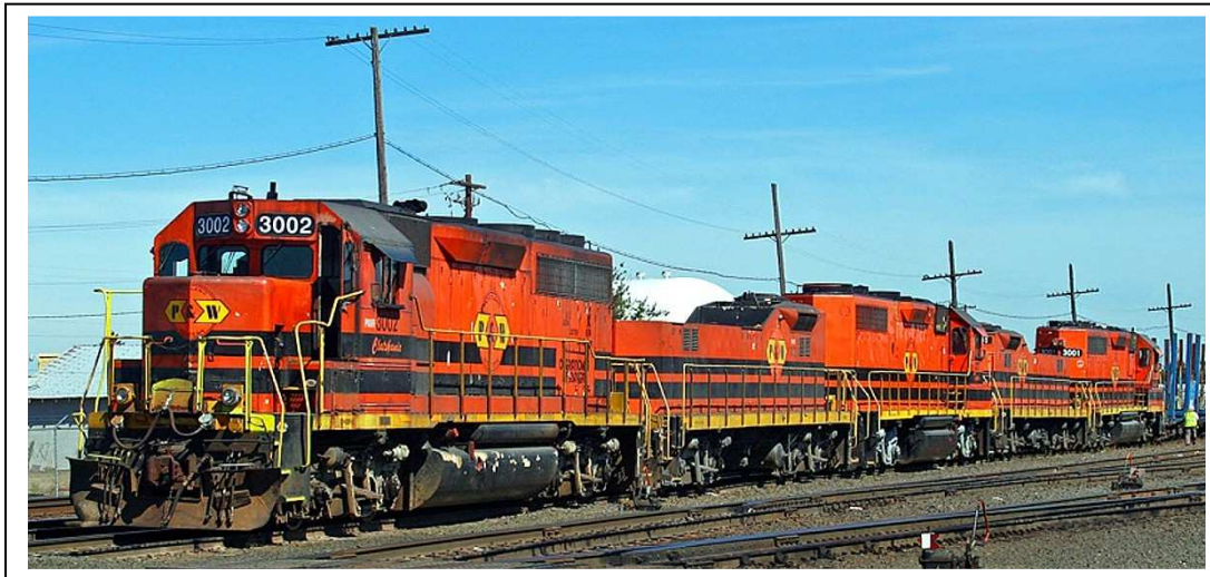
Pictured here is a Portland & Western train which is part of the Genesee & Wyoming collection of short lines.

GREENWICH, Conn. & JACKSONVILLE, Fla.--(BUSINESS WIRE)--Jul. 23, 2012-- Genesee & Wyoming Inc. (GWI) (NYSE: GWR) and RailAmerica, Inc. (NYSE: RA) jointly announced today that they have entered into an agreement under which GWI will acquire RailAmerica for an all cash purchase price of $27.50 per share. GWI's acquisition of RailAmerica will combine the two largest short line and regional rail operators in North America, strengthening GWI's ability to serve its industrial customers and Class I railroad partners. In addition, the combination should yield significant synergies and provide strong leverage to the eventual recovery of the U.S. economy, while creating a powerful platform for future industrial development along railroads in the 37 U.S. states in which GWI will do business.