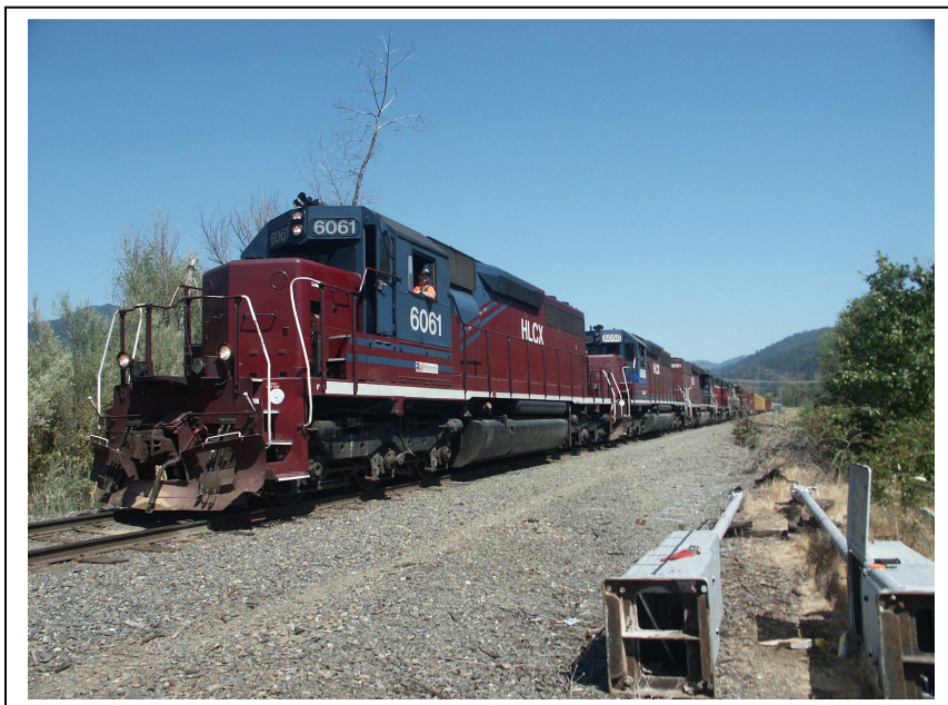
To the left is a shot of a CORP train heading north through Grants Pass in 2002. The merger must still be approved by the Surface Transportation Board which may take several months. Hopefully the new operators of CORP will be more customer oriented.