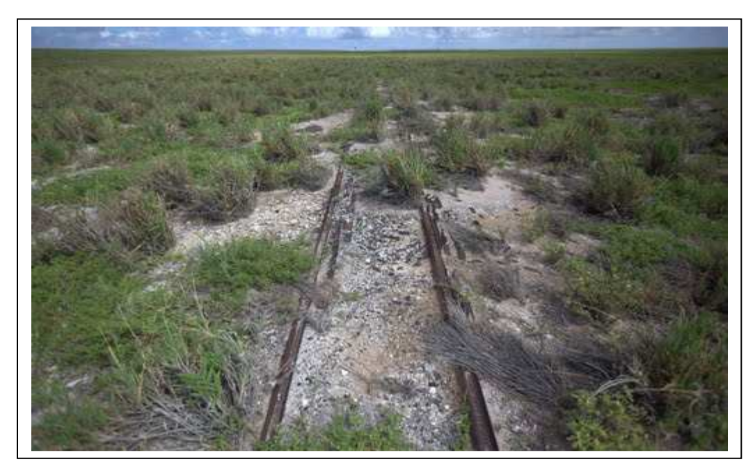
The tracks were never taken up and still remain on the island, clear a little brush and it looks like we could give it a try.

This tramway remained in use on Malden as late as 1924, and its roadbed and tracks still exists on the island today. If you open Google earth to Malden Island you can still see the tracks and some of the infrastructure of the old guano operation. The railroad extends about halfway around the island but at one time the plan was to completely circle the island as the grades and roadbed were completed. During the mining operation reports indicated that in the heavy nesting areas the guano was in excess of 2 feet deep, that's a lot of guano. The supply was never completely exhausted but other more easily obtained sources became available and operations ceased around 1927.