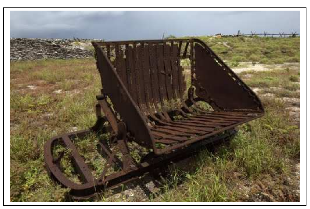
One of the side dump guano cars minus the wheels and sail, the sails were square rigged and quite large and by first hand account allowed for an "exciting" ride back to the processing plant at the end of the day.