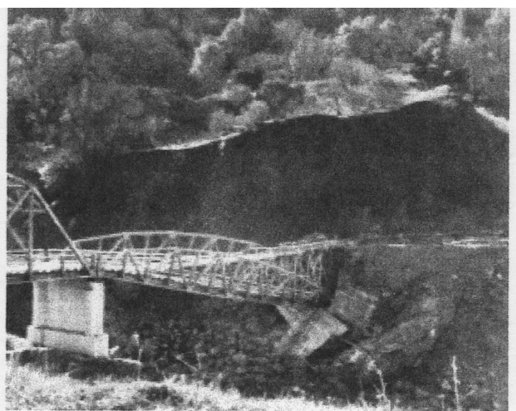
Highway 162 bridge in the Eel River Canyon. Note the vehicle hanging on the reinforced concrete driving surface of the bridge that dropped because the abutment washed out on the east end.

I was living and working in Willits, CA that winter. We received way more than our normal annual 25-30 inches in just over two weeks. Highway US 101 and local roads were closed by mudslides and local flooding.